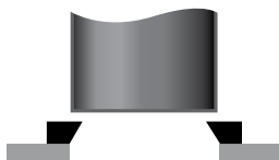
BEVELED PADS (Top View)